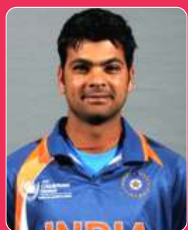
RUDRA PRATAP SINGH

Rudra Pratap Singh born 6 December 1985 in India is a left arm fast-medium bowler who has represented India in Test, One Day International and Twenty20 International cricket. He currently plays for Royal Challengers Bangalore in the Indian Premier League.